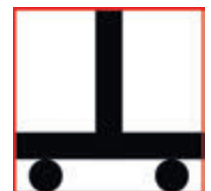
MOUNTED ON STAND WITH WHEELS