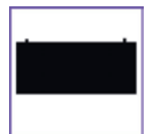
MOUNTED ON WALL PANEL