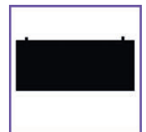
MOUNTED ON WALL PANEL