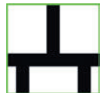
MOUNTED ON METAL STAND