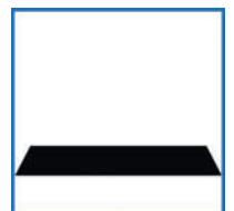
MOUNTED ON BASE