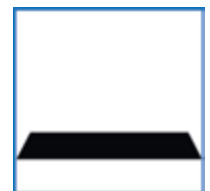
MOUNTED ON BASE