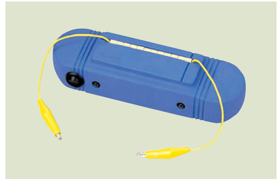
PIKOPIKO Galvanometer (light-moving galvanometer)