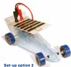
Set-up option 2