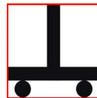
STAND WITH WHEELS

80cm x 100cm x 130cm (L x W x H) Net Weight: 200 kg Gross Weight: 275 kg