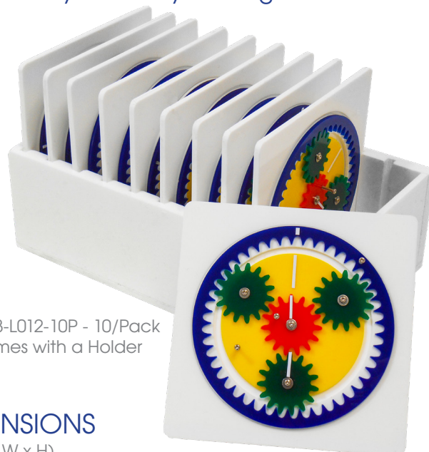
N98-L012-10P - 10/Pack comes with a Holder

By stopping the Ring Gear and rotating the Carrier, the Sun Gear rotates with acceleration. Gear ratio is 0.25