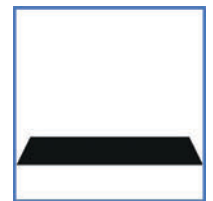
MOUNTED ON BASE