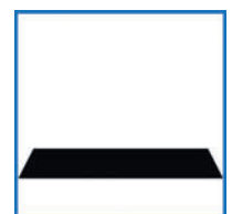
MOUNTED ON BASE