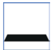
MOUNTED ON BASE