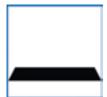
MOUNTED ON BASE