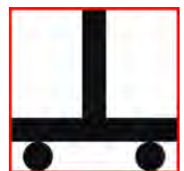
MOUNTED ON STAND WITH WHEELS