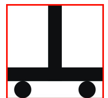
MOUNTED ON STAND WITH WHEELS